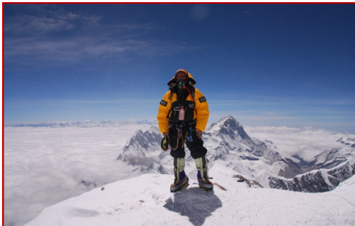
Sherpa at the Summit of Everest