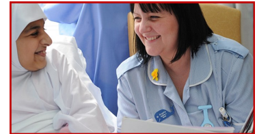
National Institute of Health Research