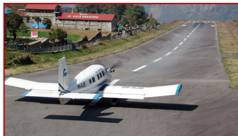
By Alan Pearce