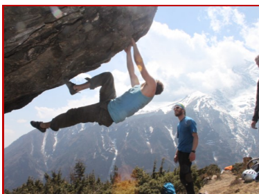
By Nelson Diamond