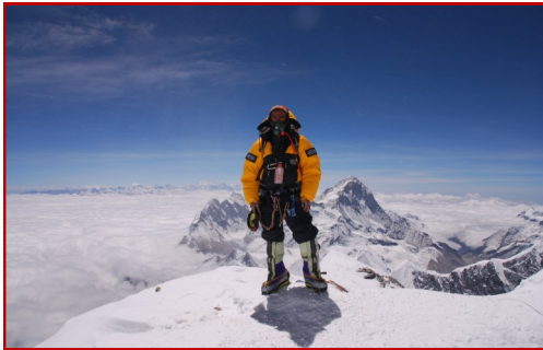
Sherpa at the Summit of Everest

The conference will deliver the latest research, experiments and knowledge learnt from the Everest laboratory.