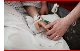
Care required on ITU