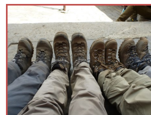
These boots are made for walking