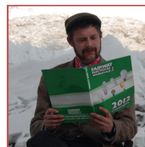
I love lamp!

You can do this by visiting the Publication page on the Xtreme Everest page, where publications are listed by expedition with new ones being added as they are published. Xtreme Everest have also made a commitment to publish their papers on open access sites, to enable a greater access to our research to the public and well as those in the medical industry.