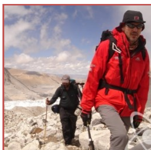
Can I come down now??

Xtreme Everest holds a large archive of stories, papers, blogs, photos and media which covers the 11 years that the project has been alive.